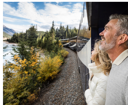
Exclusive Outdoor Viewing Platform