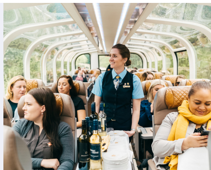
Complimentary Wine & Cheese